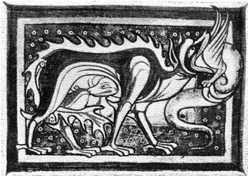
THE HYDRUS ENTERING THE CROCODILE'S MOUTH (Petersburg MS.)