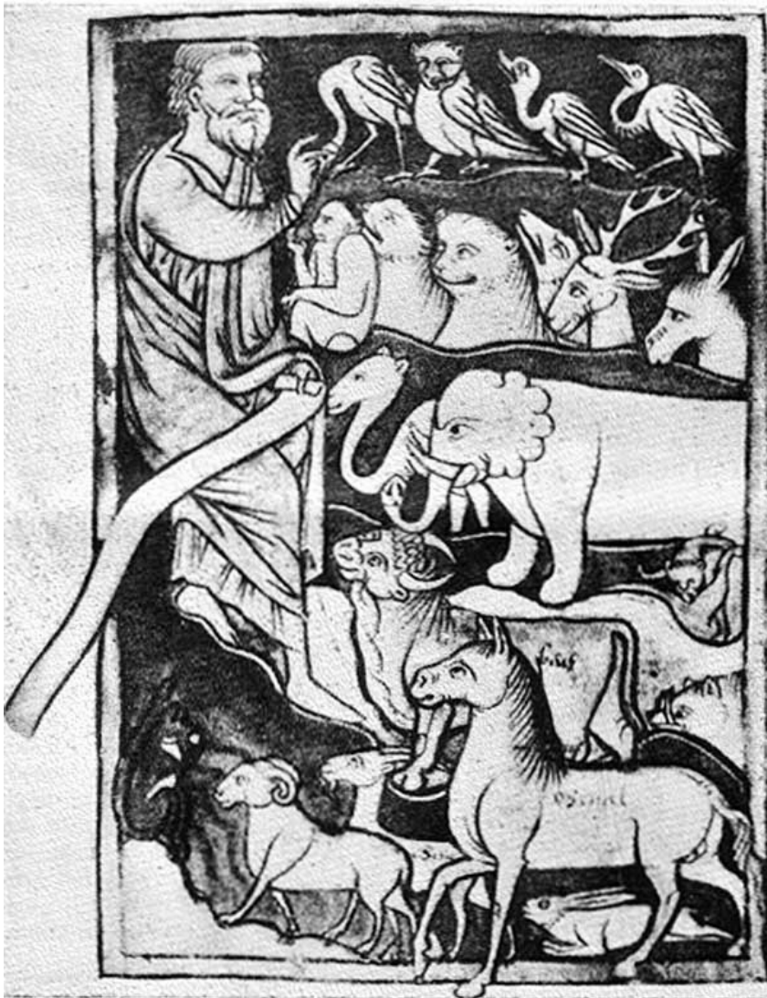
ADAM NAMING THE ANIMALS (Petersburg MS.)