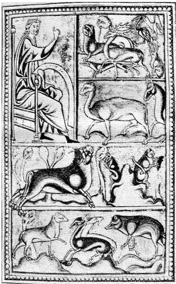
ADAM NAMING THE ANIMALS (Aberdeen MS.)