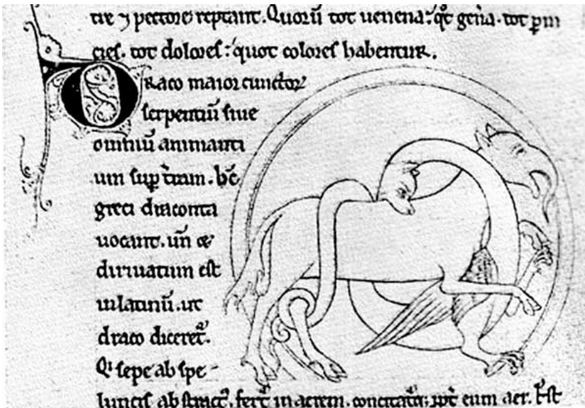
THE ELEPHANT AND DRAGON FIGHTING (Cambridge MS.)